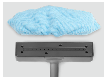
Mount for microfibre cloth - SP240

The foldable steam mop is designed for cleaning and disinfecting smooth surfaces such as floors, walls and ceilings. It is used with a microfibre and leaves no deposits on treated surfaces.